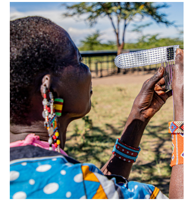
18million KES beadwork sales